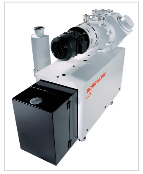
SCREWLINE SP 630 vacuum system with Roots pump (2000 \ensuremath{m^3/h}\xspace)